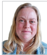
Mrs B Wild Nursery Practitioner