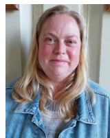
Mrs B Wild Nursery Practitioner